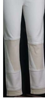
Cut and sew panel natural