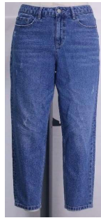
Purple cast Indigo