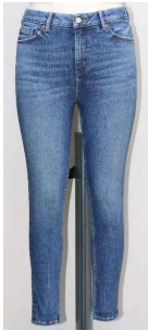
Subtle towel bleach